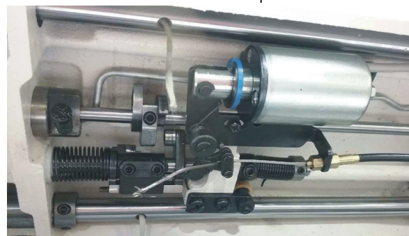
Electric Trim Motor