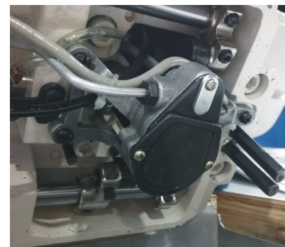
Automatic Oil Pump