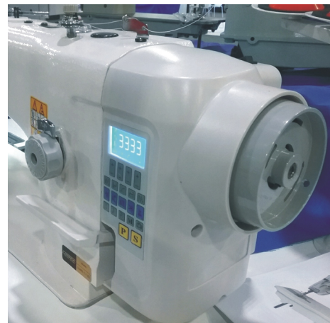
Display and Control Panel, Direct Drive motor built in.