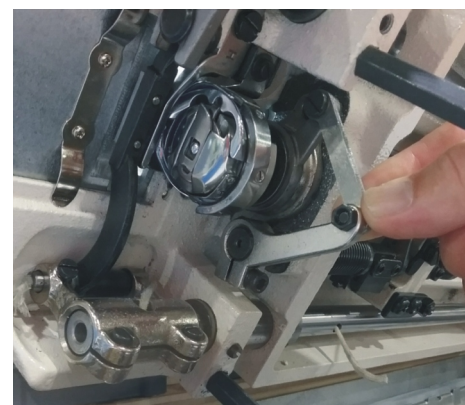
Simple Trim Mechanism